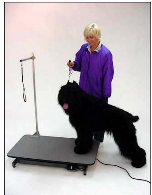
LOW BOY® at height of 6 inches