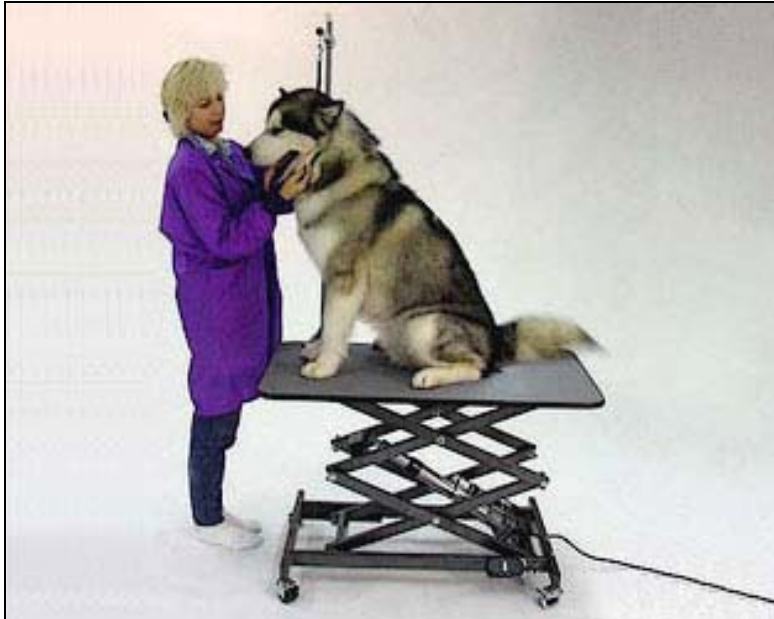
LOW BOY® ELECTRIC SCISSOR LIFT

Fax: (845) 603-6603 Toll Free: (855) 40ASCOT e-mail: info@AscotProducts.com